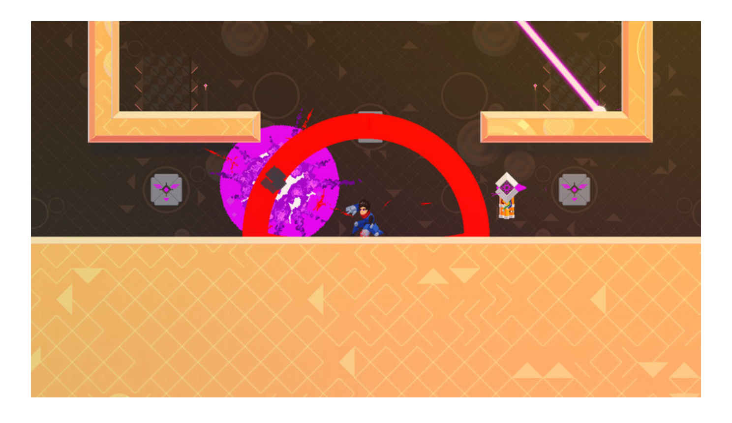
Skin - Maniac Viking Free Download [key]

Download ->>> <a href="http://bit.ly/2SJzoUU">http://bit.ly/2SJzoUU</a>